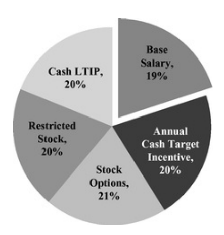
NEO Average Pay Mix